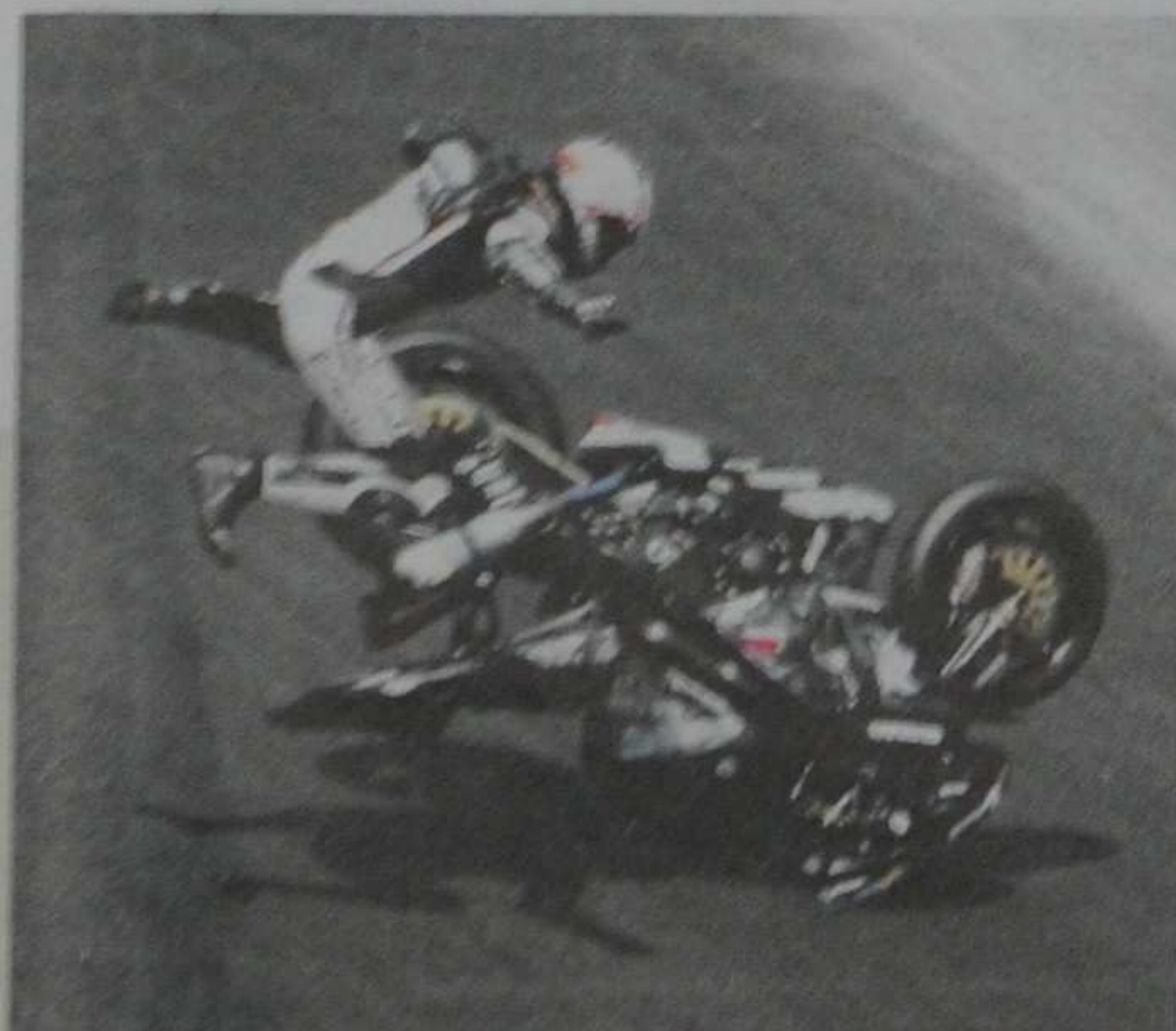
... he lost it at the bottom of Paddock Hill bend...