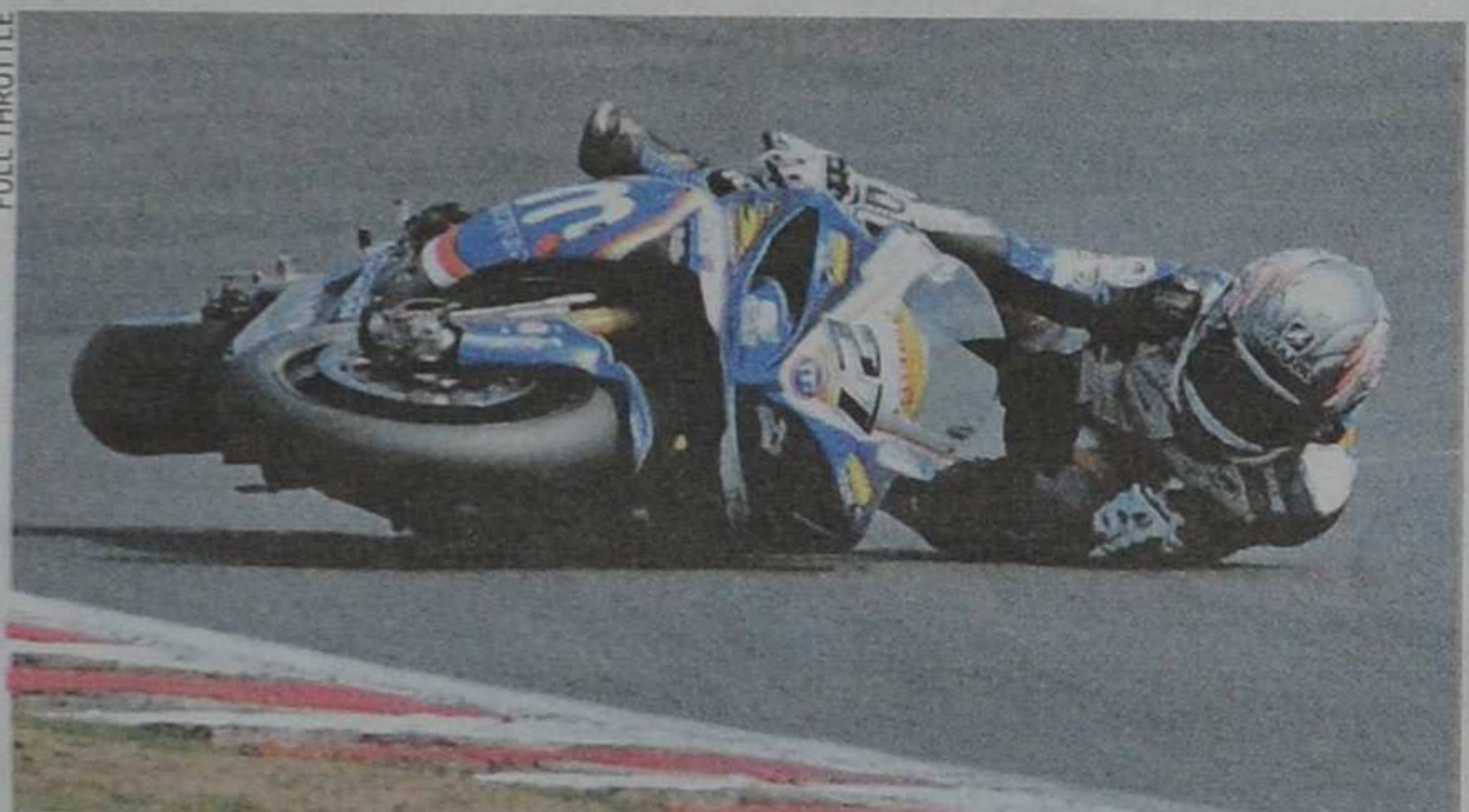
Westmoreland's Motorpoint Yamaha slides off at Graham Hill bend